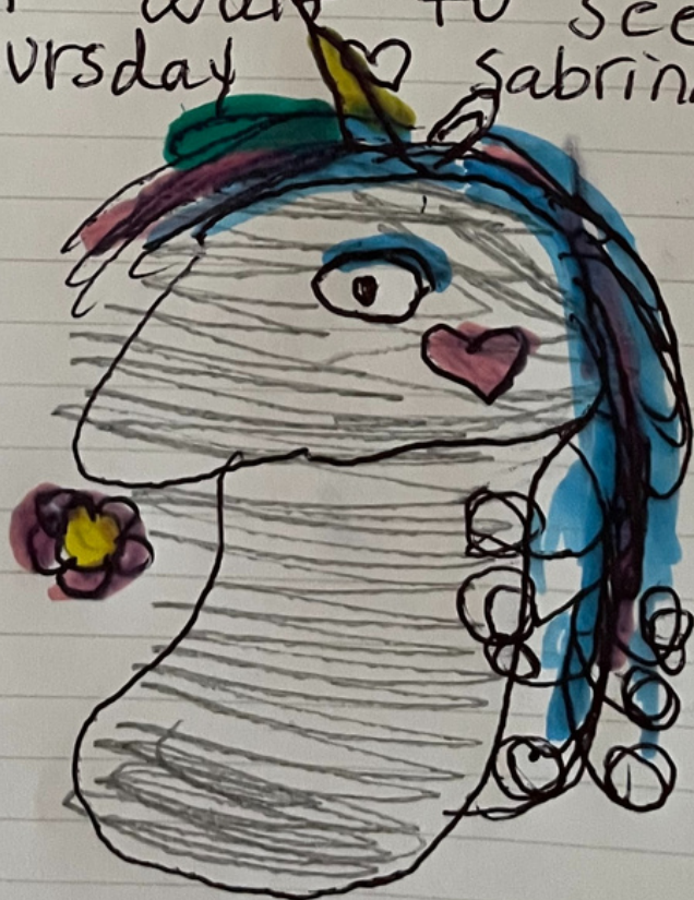
Unicorn for anika